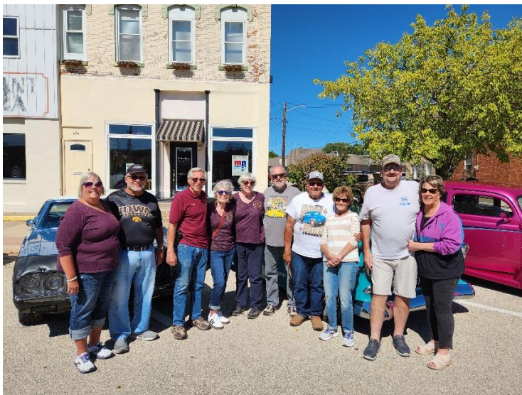
Group Picture downtown Geneseo, IL