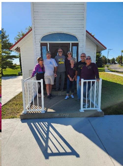
Stop at country church on cruise home