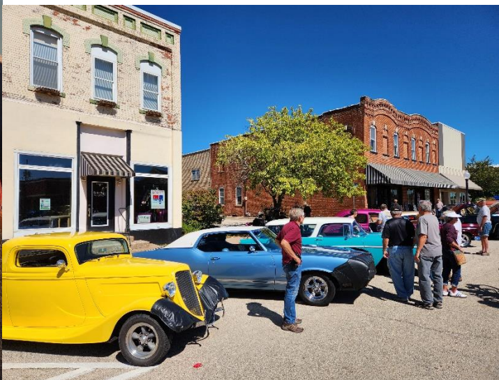
Saturday Downtown Car Show Geneseo, IL