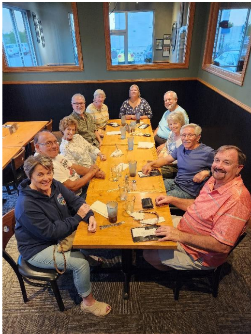
Friday night dinner Geneseo, IL "Sweet Pea's Bar & Grill"