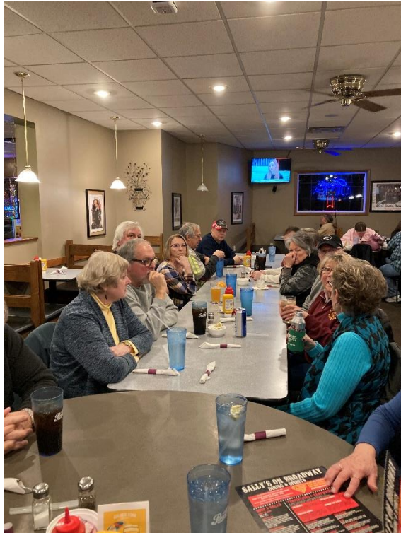
A fun group of members attended the dinner out at Sally's