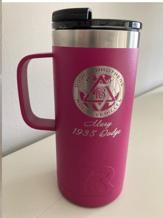
These are pictures of a mug that is similar to the burgundy ones with the club logo that we are planning to order.