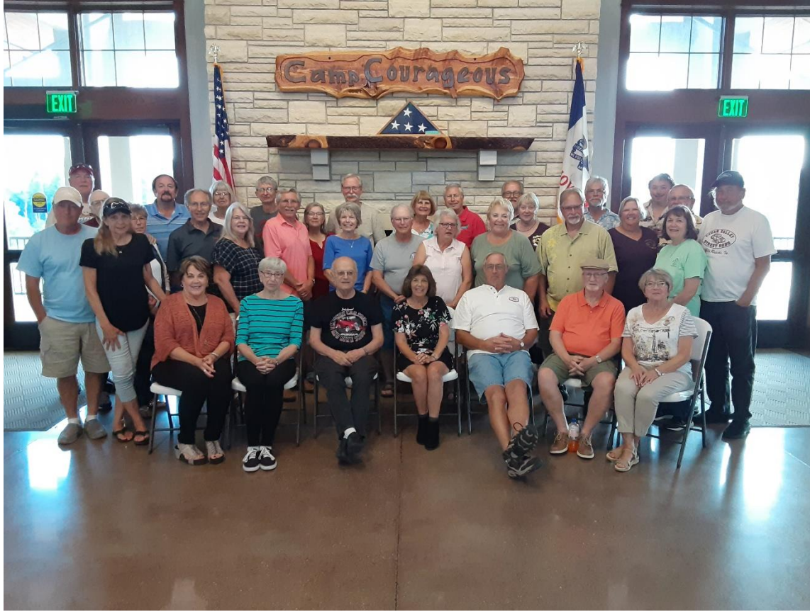
Many members attended our June meeting & Banquet