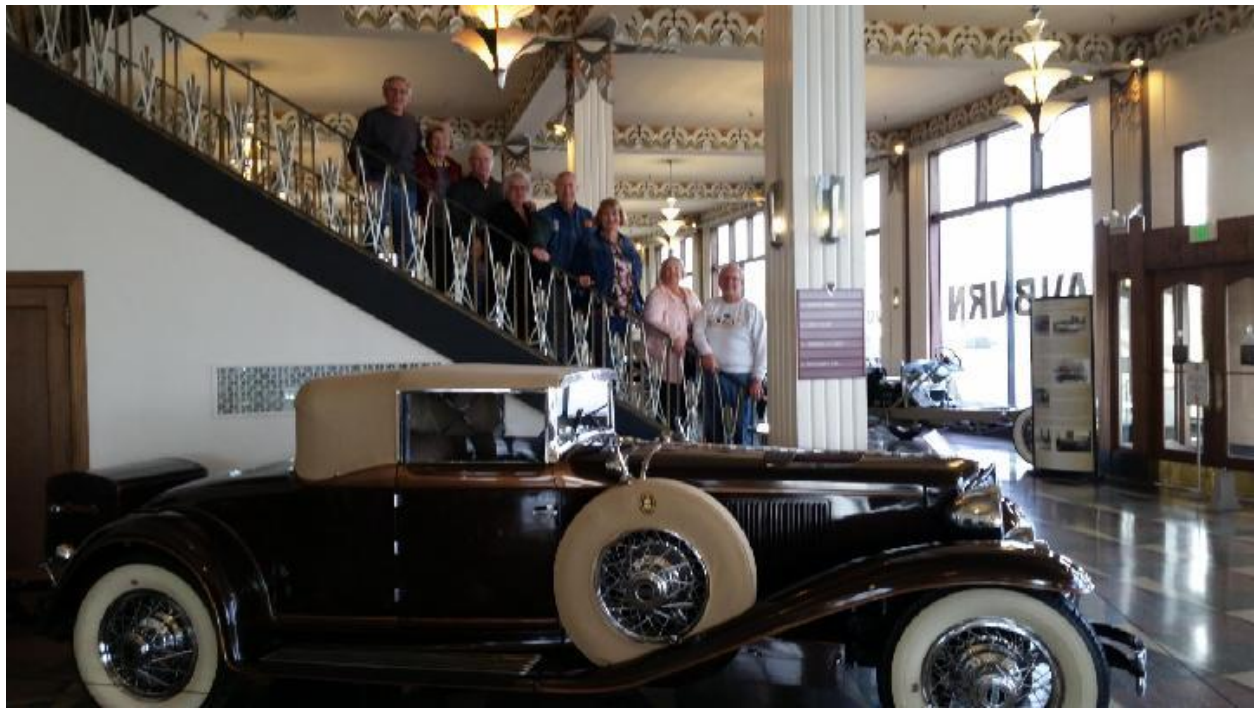
Beautiful architecture & cars at the Deussenberg Museum!