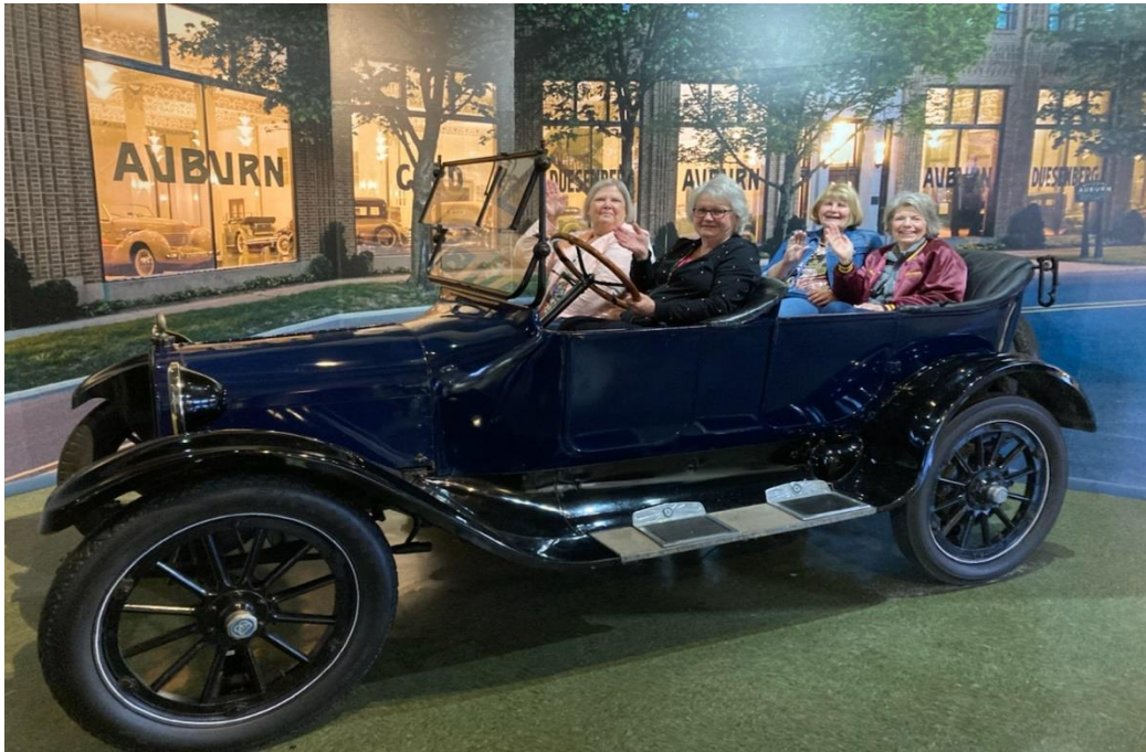
Watch out! Girl's Road Trip!