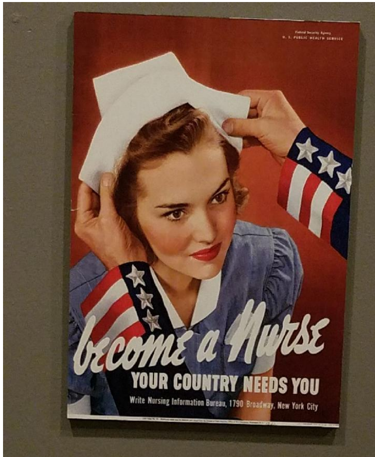
The Grout Museum had some beautiful signs & art.