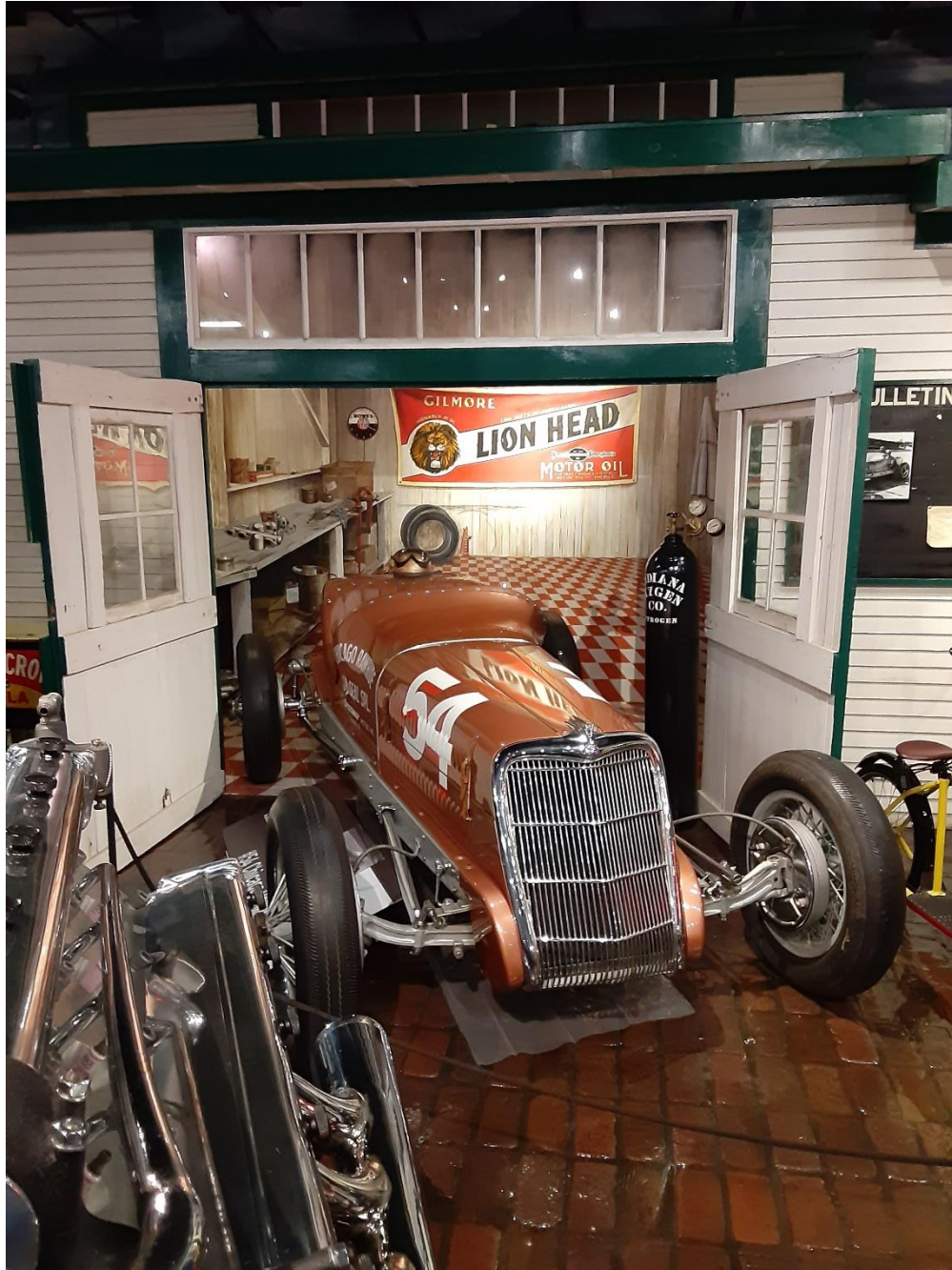
Display showing race cars in their actual shops.