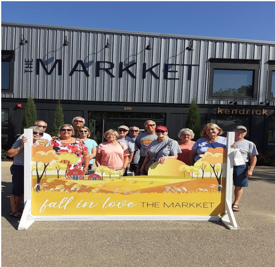
We had fun shopping on our trip to Backbone!