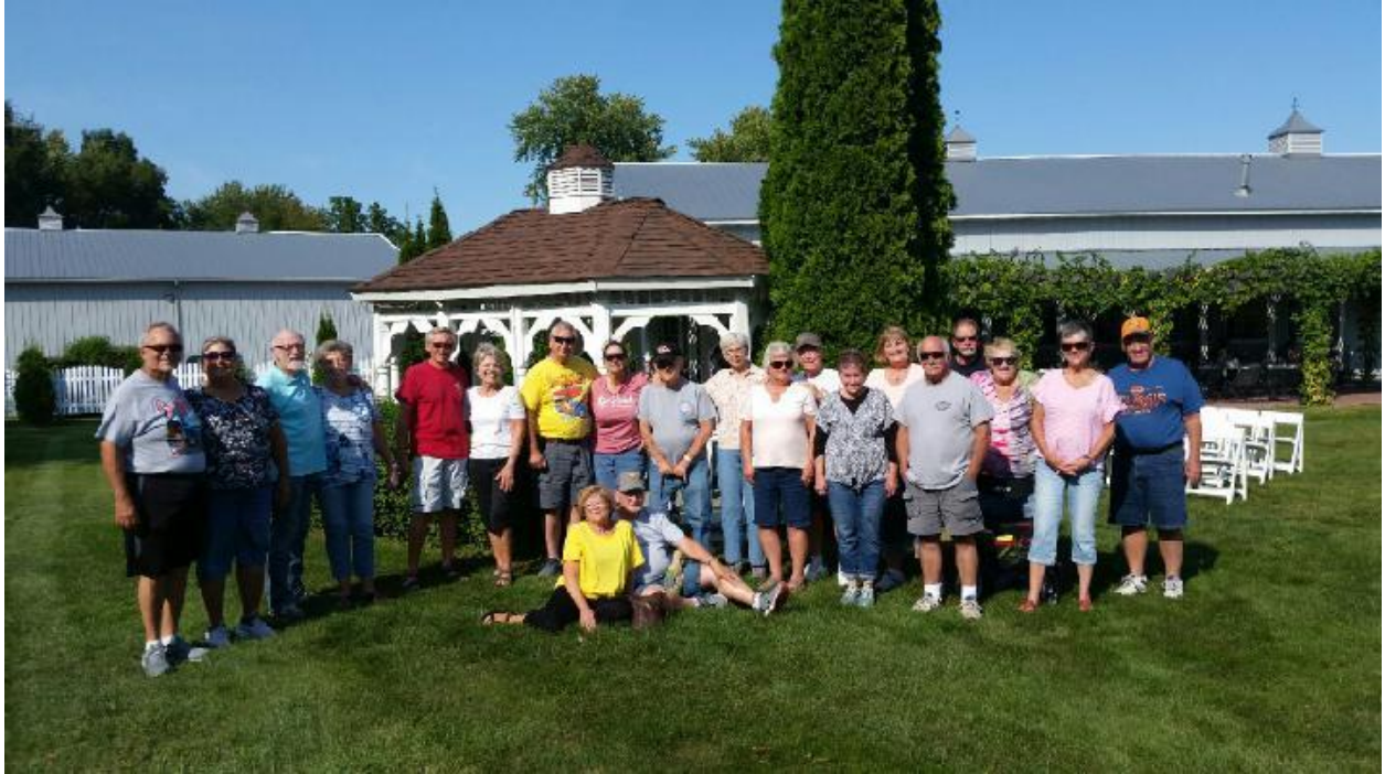
At Lavender Crest Winery in Colona, IL