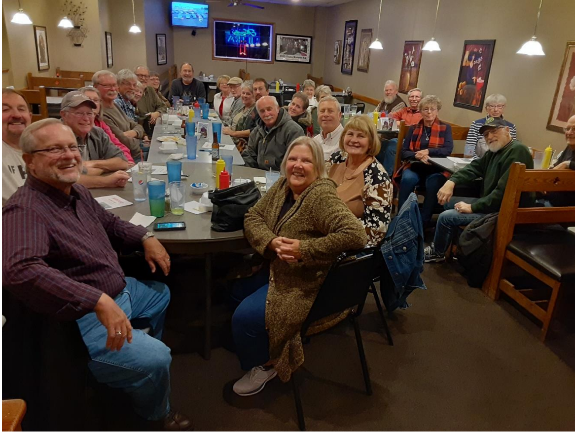
We had a large group at our dinner out to Sally's in Springville on November 17th